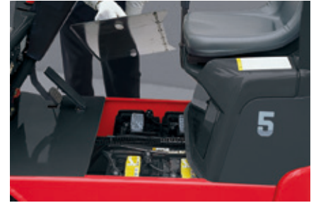
A high-capacity battery offering ample power and a long service life combined with easy maintenance