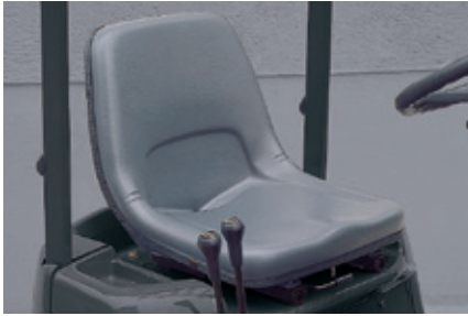
Form-fitting seat for exceptional operator comfort