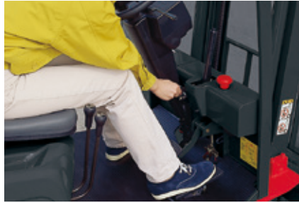
Neutral safety feature helps prevent operation mishaps